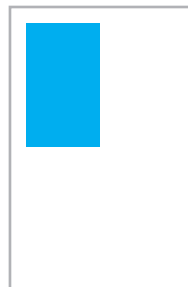
Quarter Page 2.25" x 3.75"

Full Bleed 6" x 9" Includes .25" of bleed on all sides